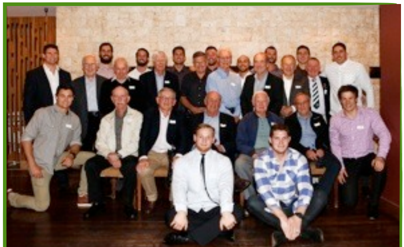
The original 1964 Rats 1st XV pose with the current 2014 Rats 1st XV during the FOW Annual Dinner