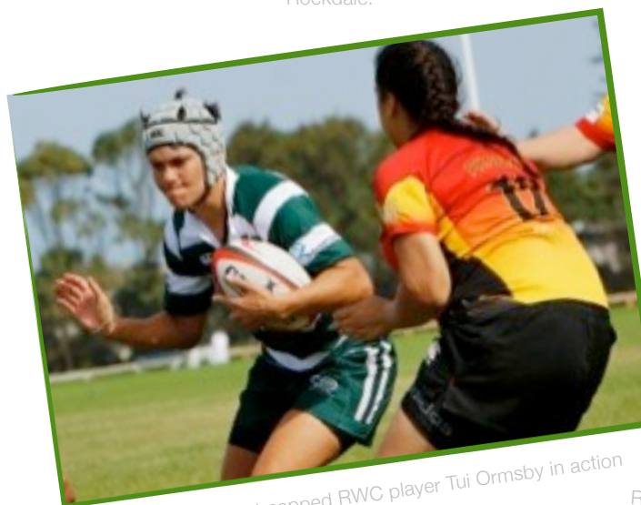
Australia's most capped RWC player Tui Ormsby in action