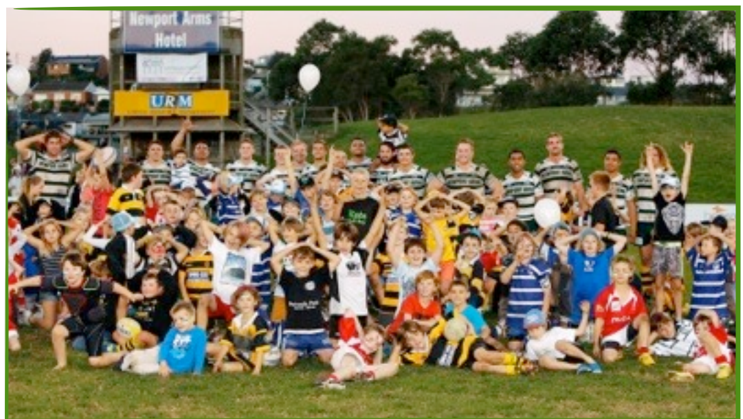
The Rats 1st XV pose with youngsters from the Warringah Junior Clubs after the team defeated Randwick at Rat Park in June 2014.

“ The trading activities of the gate, car parking, canteen and bar have proved a success and sustained us. ”