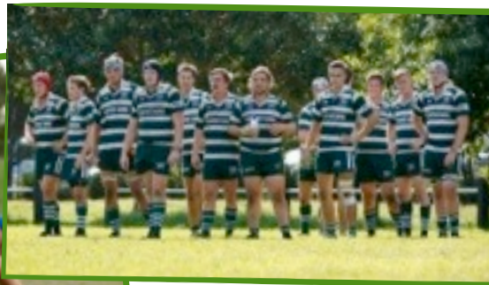
The Colts stand united