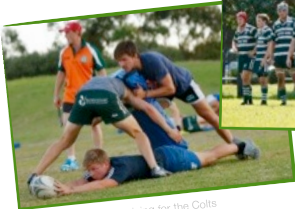
Pre-Season training for the Colts