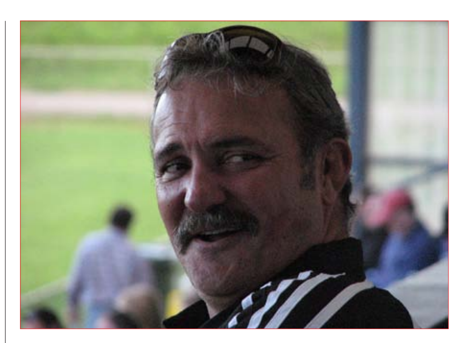
players want to come to and stay at.

It is not easy but it is something that we should continue to strive for.