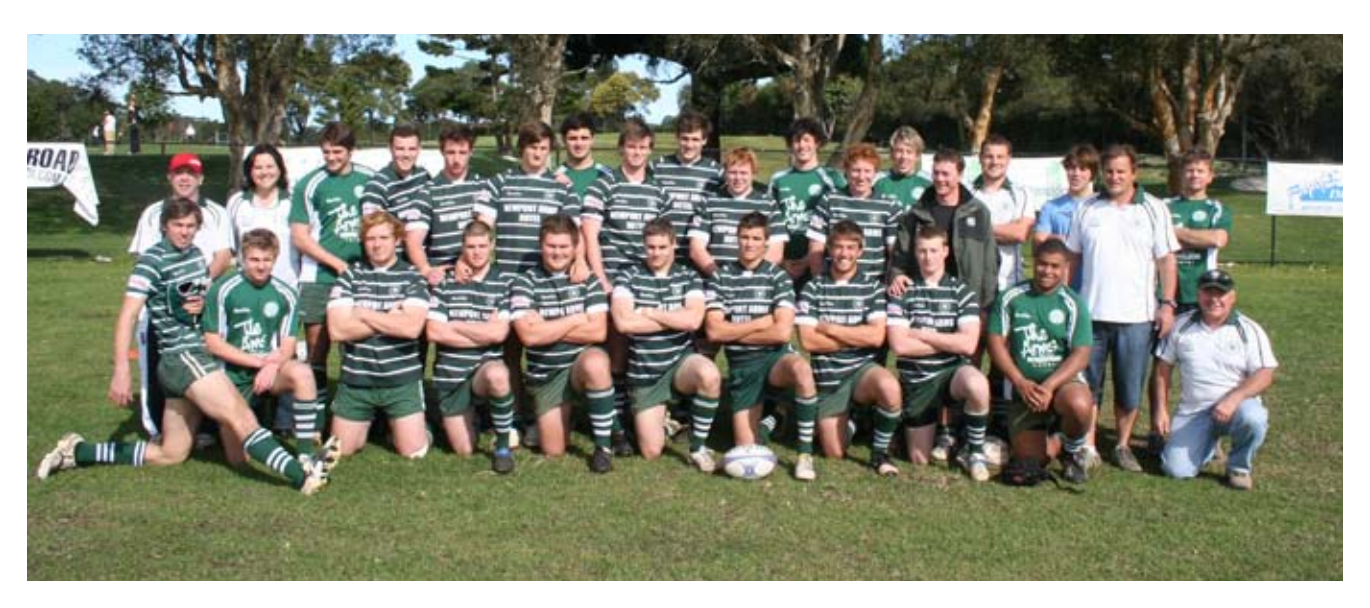
The First Grade Colts Finals Group - Woollahra Oval - September 2010c