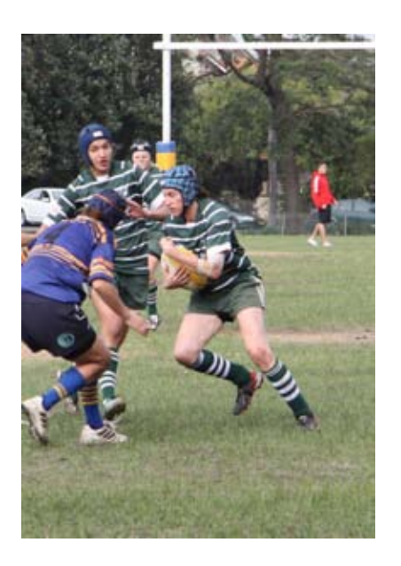
Cup in London on the same day.

2010 was an epic season for all players who pulled on the Ratettes jersey. Although we ultimately lost the Grand Final to Sydney University 23-10, I cannot conjure the words to explain how proud I am of the girls who played both in this match and for the Wallaroos in the World