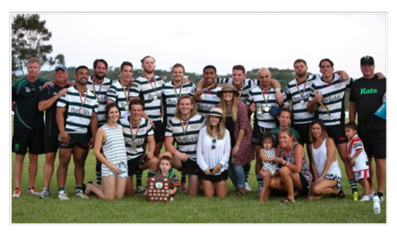
The Mens RATS 7 team and supporters following the win at Crescent Heads 7s