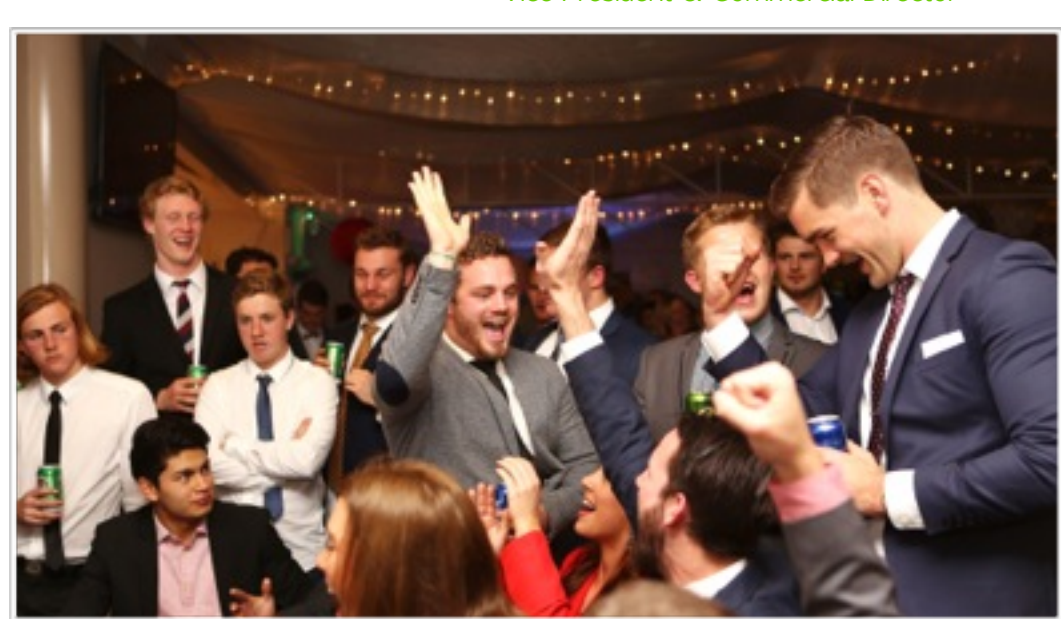
Players, sponsors and guests celebrate during the RATS Annual Presentation Night

We have made capital commitments to support player growth and development.