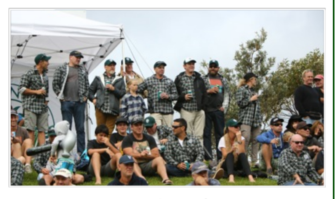
The Hillbillies, wearing their regulation "Hillbilly Flannies" take in all the action at Rat Park from their permanent spot on the Hill at Rat Park. These die-hard Rats fans are so popular they even got a mention in the Manly Daily.