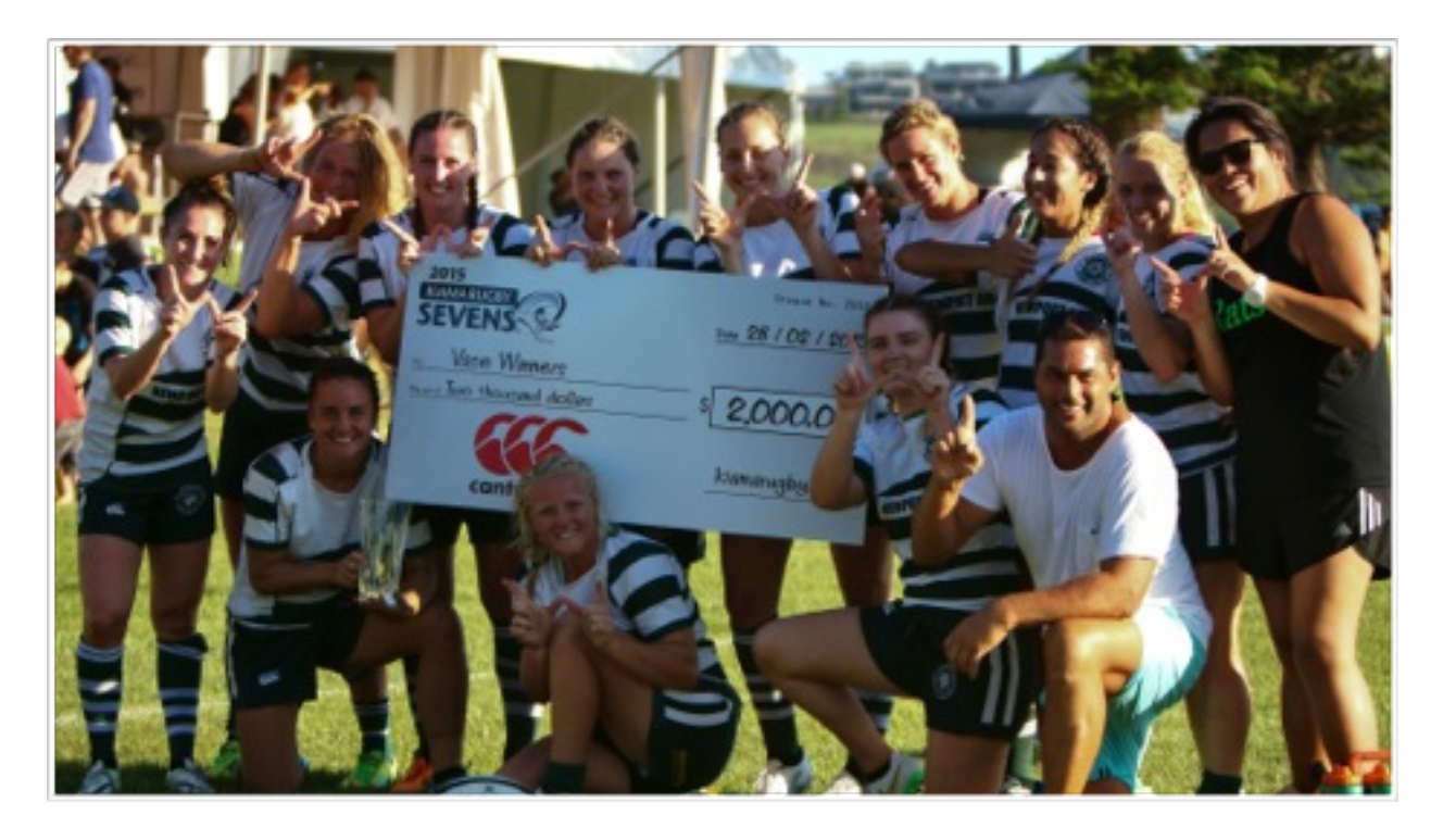
The victorious Womens 7s team with their Kiama 7s winners cheque